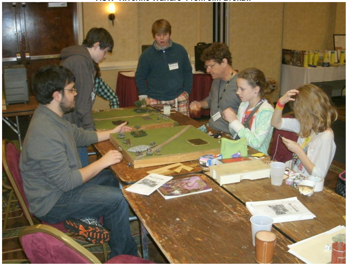
Pre-Graying Hobbyists At Work-