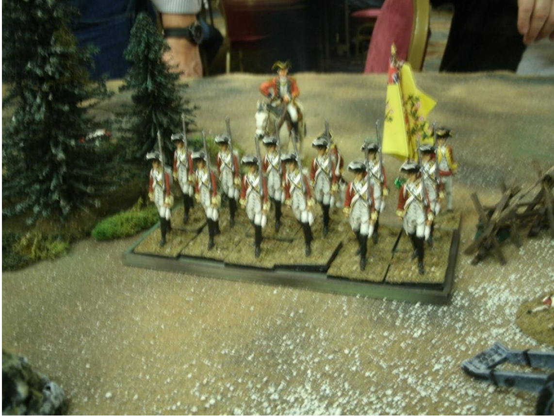
All The King's Men Demo Games-Always Colorful

Tournament Play-Great Figures, Indifferent Terrain