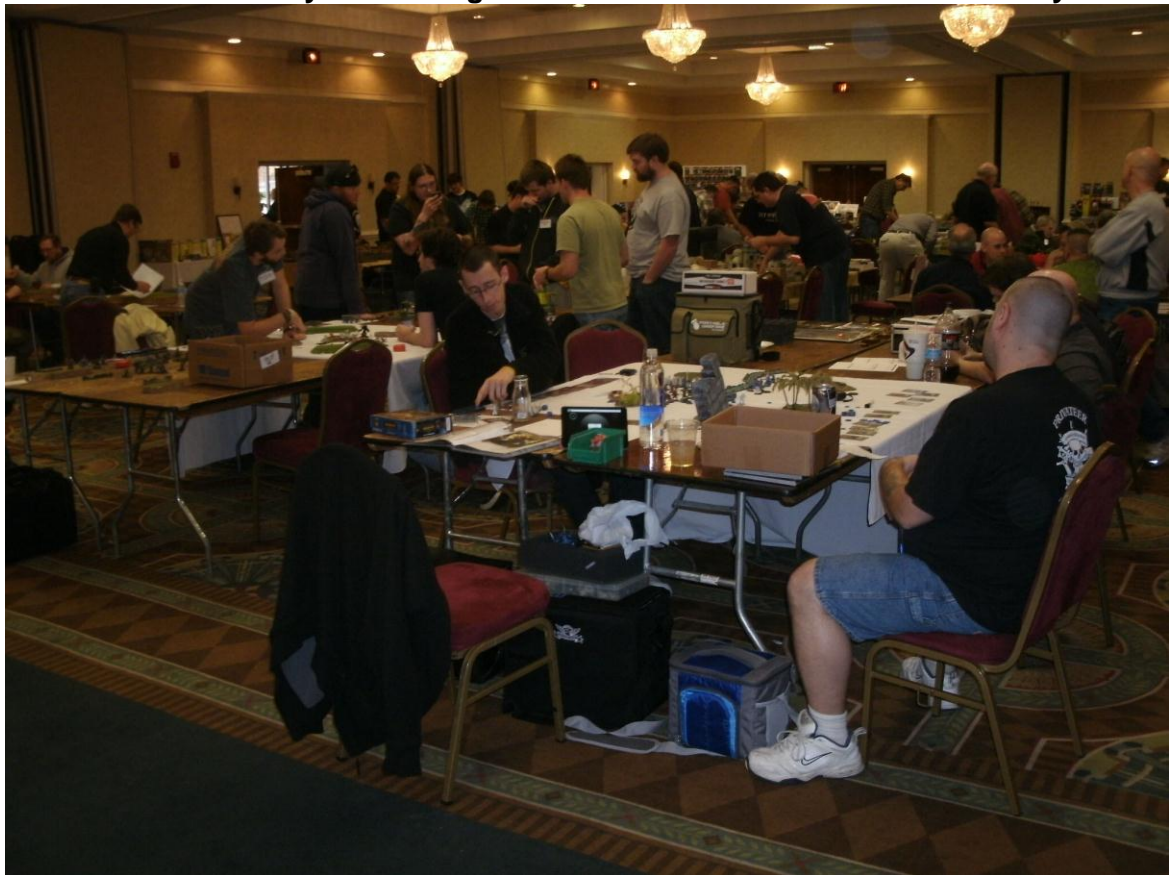
The Crowds Built Up To A Comfortable Buzz-Indicating A Successful Convention