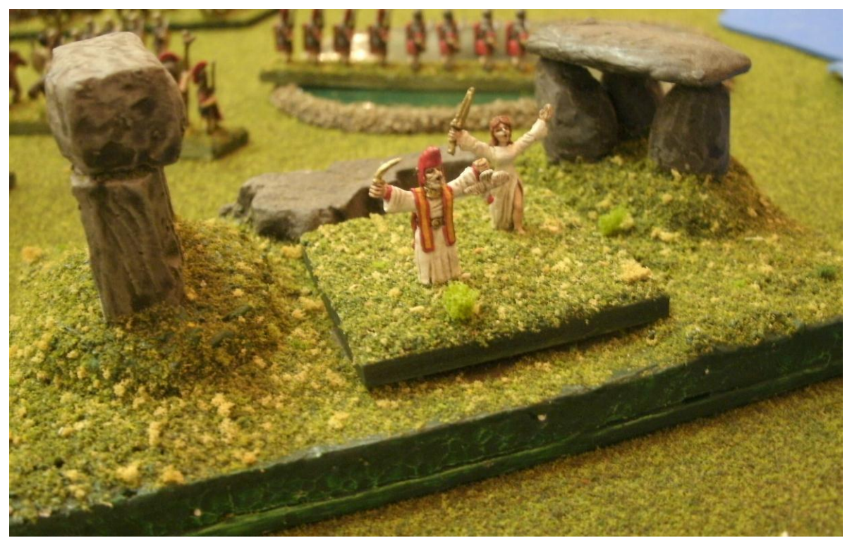
Druids Contend With Witches To Control DBA Dice Saturday Night