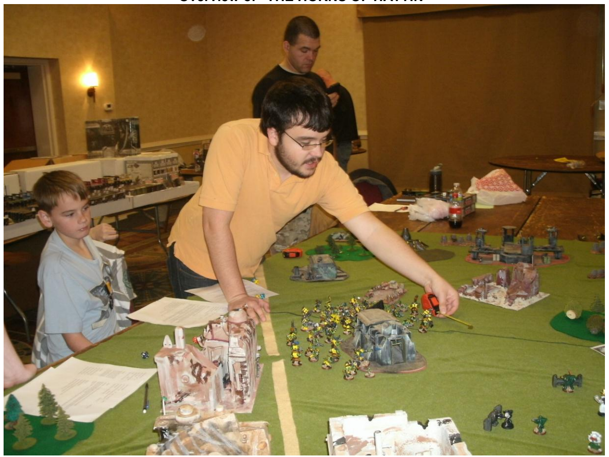
Dark Side-But These Guys Stayed To Get The Most Out Of The Convention