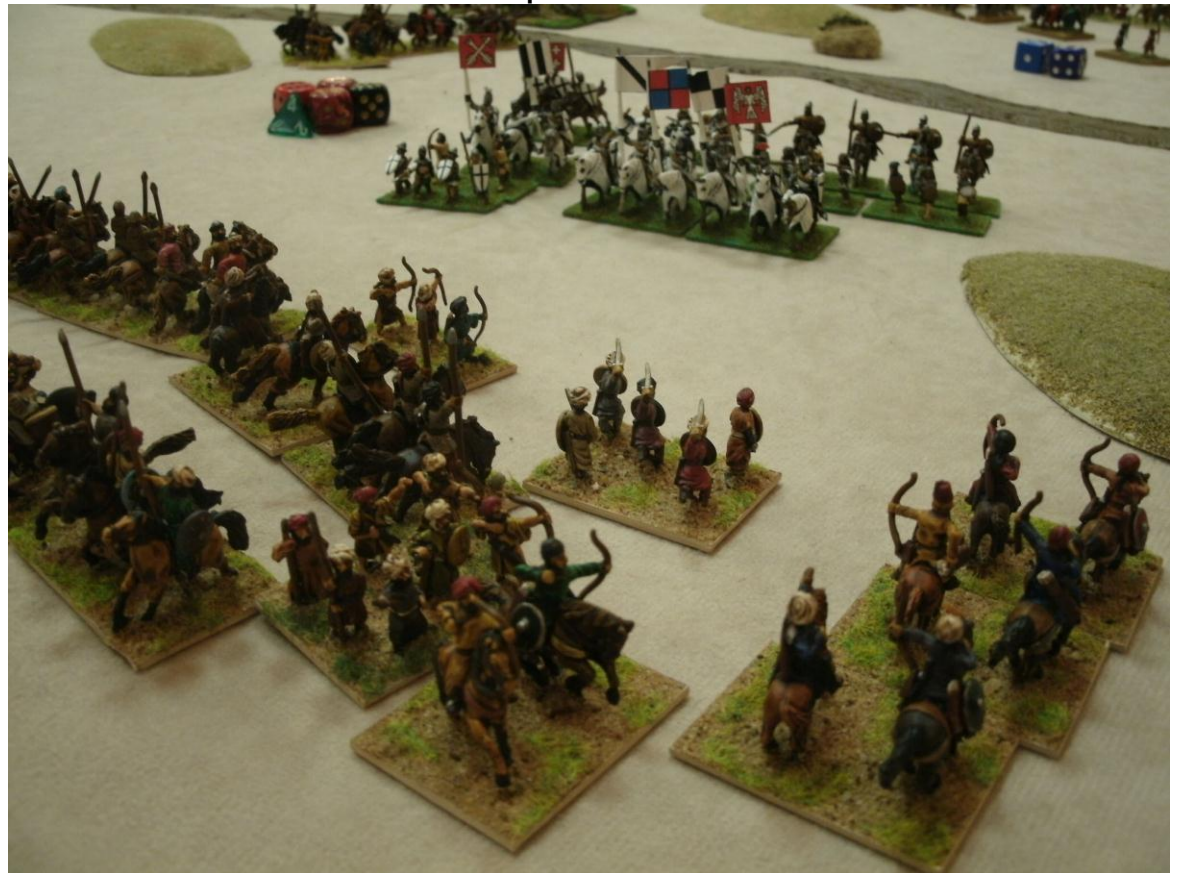
"THE KINGDOM OF HEAVEN"The Horns Of Hatin In DBM As Convention Winds Down On Sunday