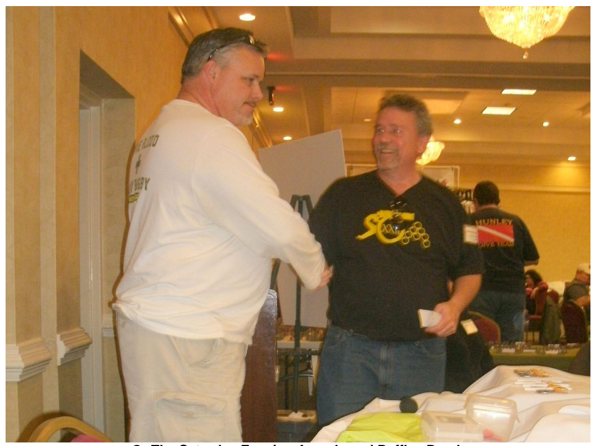
Or The Saturday Evening Awards and Raffles Break