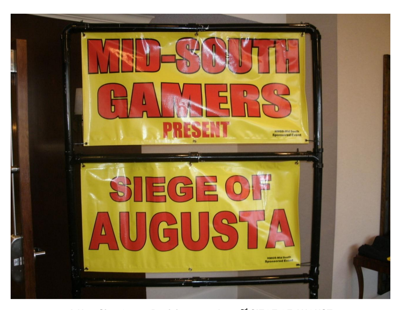
A New Sign Greets Participants at the 22<sup>nd</sup> SIEGE OF AUGUST

January 18-20 2013 Doubletree by Hilton 2651 Perimeter Parkway Augusta Georgia