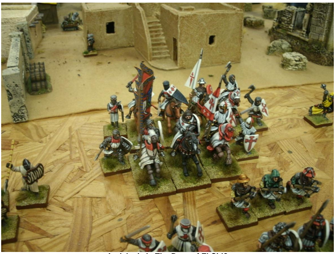
Andalusia In The Days of El Cid?