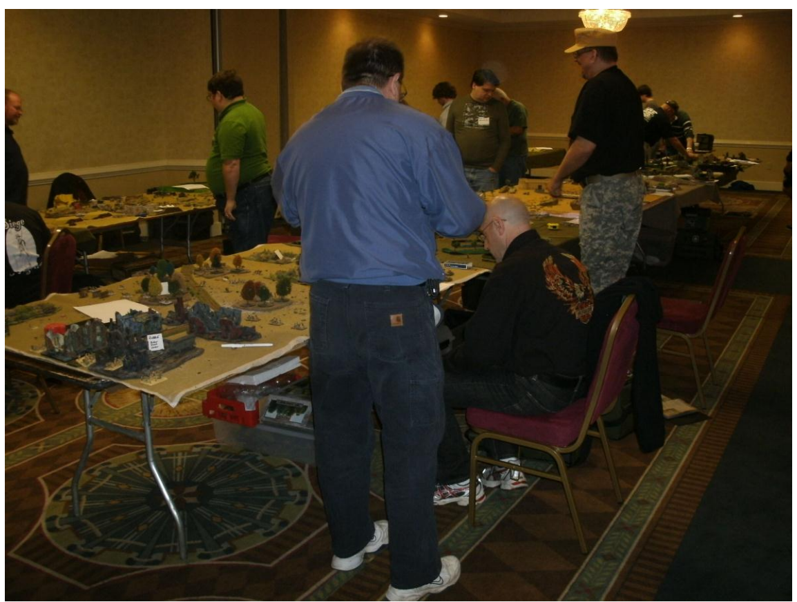
Of Course No Convention Is Complete Without A Flames of War Tournament