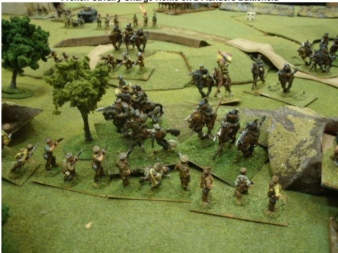
Another Cavalry Charge To Determine The Spanish Government-March 1937

French Cavalry Charge Home on a Flanders Battlefield