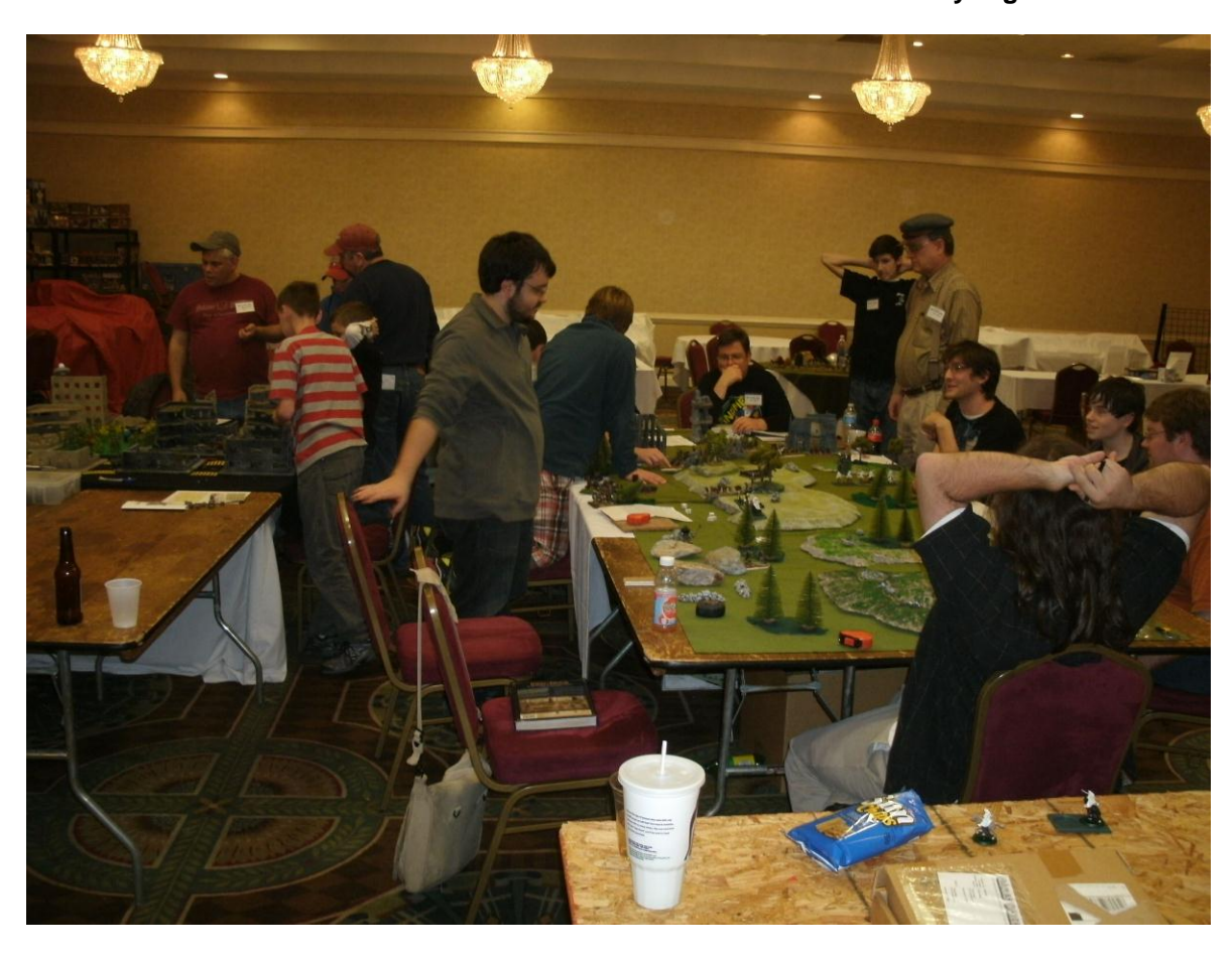
While An LOTR Game Distracts A Large Cast Until Quite Late