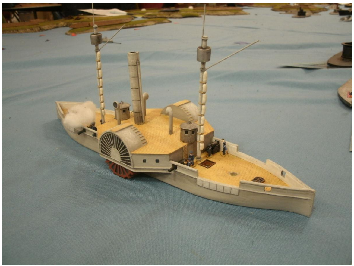
ACW Riverine Warfare