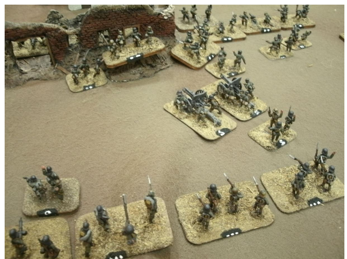
WWI German Storm Troopers In What Looks Like WWI FOW