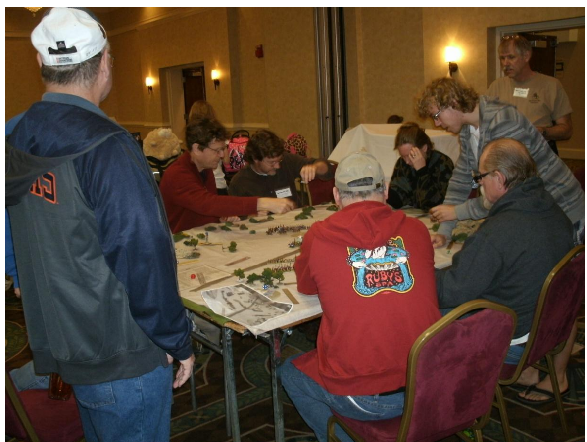
Overview of "THE HORNS OF HATTIN"