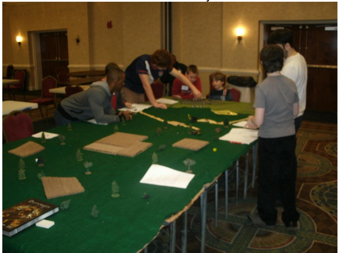
Younger Players Getting Started