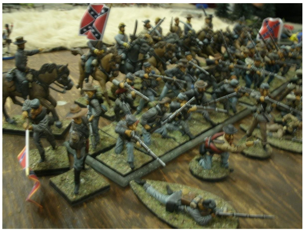
This Was The First I Had Seen of ATKM ACW Figures-Excellent